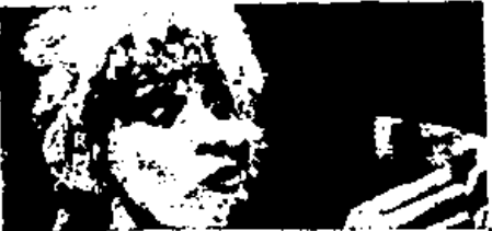
Me? Read the classifieds?

Publishers Sidgwick and Jackson said the new book is "on offer to several publishing houses in the United States."