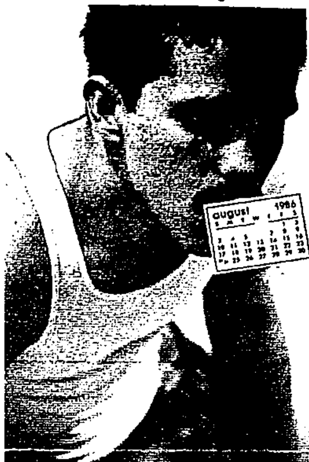
August, from the Hunks of Nicaragua calendar.

BOSTON, MA (GCN) - To commemorate the seventh anniversary of the Sandanista revolution in Nicaragua a group of Gay activists has released its first issue of the "Hunks of Nicaragua" calendar. The four-page pamphlet by the Boston-based United Fruit Company combines a parody of Gay skin magazines with facts about the revolution.