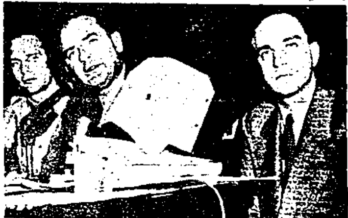
David Schine, Joseph McCarthy, and Roy Cohn (l-r) at the Army-McCarthy hearings.

alleged Soviet spy ring. The Rosenbergs were eventually electrocuted, and Cohn went on to even more prominence as chief counsel to Sen. Joseph McCarthy's infamous subcommittee which had vowed to "root out Communism in government."