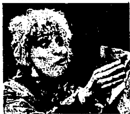
Me? Read the classifieds?

With the go-ahead to put on their dancing shoes, Hawkins appeared at the prom in a black tuxedo with a top hat and Salgado came decked out in a formal gown. According to Turner, the two women "were never asked by any boys to dance," but they had a wonderful time.