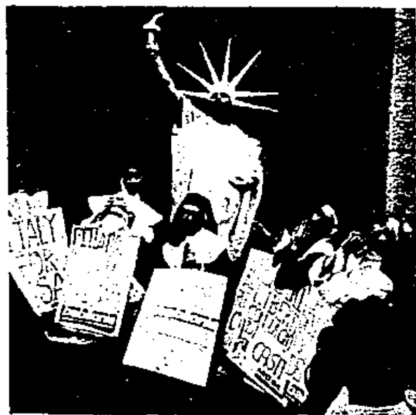
Penitent gay Italian nuns outside the offices of Italy's major newspapers, Milan.

MILAN, ITALY (GCN) - Protests over the U.S. Supreme Court decision upholding states' rights to ban sodomy have spread across the Atlantic. On July 9, a group of Gay men protested the decision as an act of solidarity with U.S. Lesbians and Gay men and because the ruling may have repercussions in heavily Catholic Italy according to "Babilonia", an Italian Gay monthly.