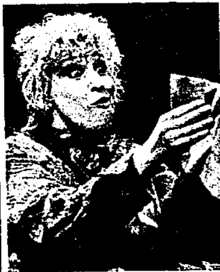
Talk, talk, talk, where the hell are the classifieds?

The I.A.C., which was formed five years ago, also hosted a hospitality room at the convention headquarters and a dance attended by over 2,000 people the night before closing ceremonies.