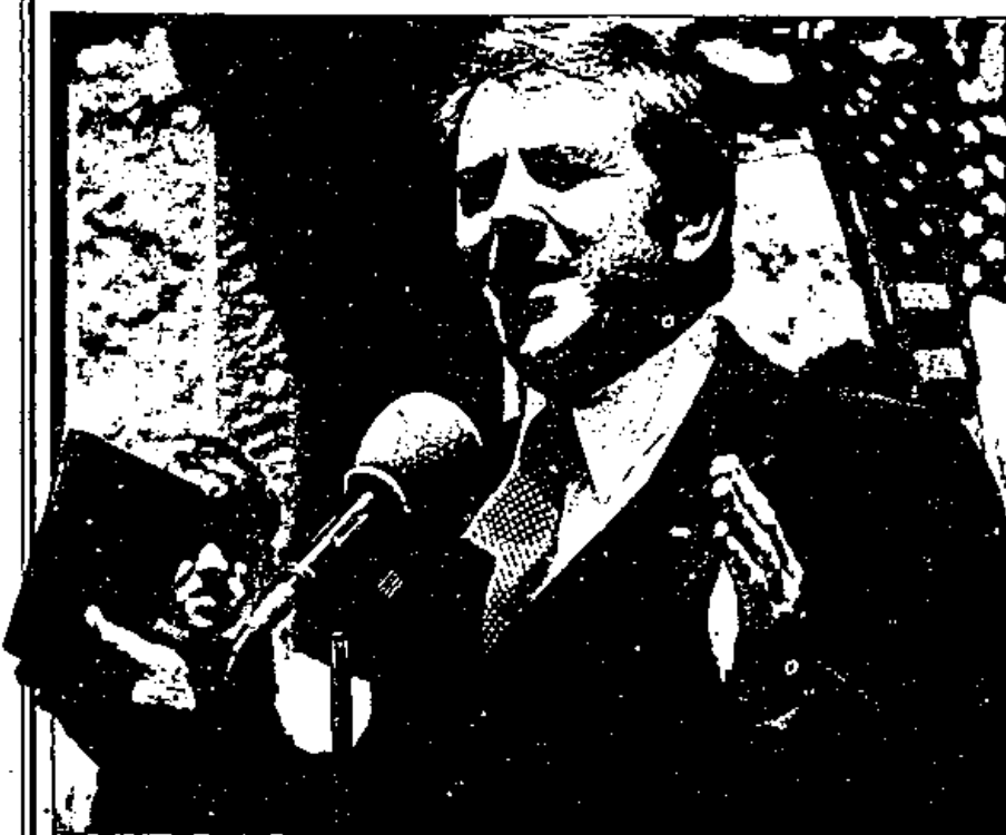
Jerry Falwell on the ERA: "God did not make women for NFL football or combat."