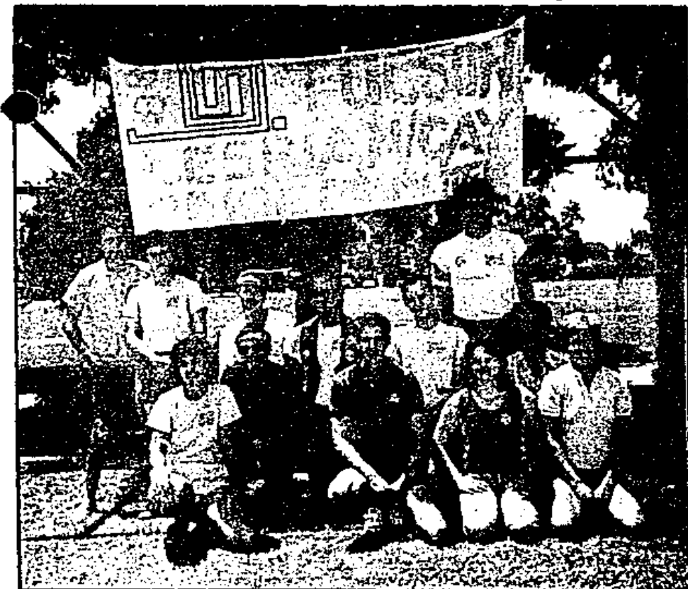
TUCSON - Shown above are a few of the members of the Tucson Lesbian and Gay Pride Committee. Every member worked

hard and long to produce the week-long Pride Week '85 festival last month. All are to be congratulated. Tucson Lesbian and Gay Pride Week is now history. This leaves myself and the other members with mixed feelings. It is real nice to be able to take a deep breath and relax after several weeks of what seemed unending work, but it is also sad to let go of the sense of unity and strength and indeed intense pride that we all felt throughout the week. If nothing else was accomplished, it was surely enough reward to just have experienced sharing with all the beautiful people that participated not only in the planning but in the enjoyment of attending all the activities. I thank you all for this week's experience.