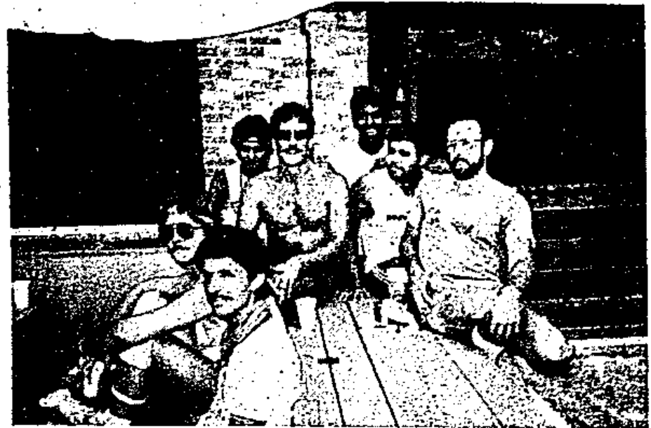
JOSHUA TREE "PUSSYCATS"