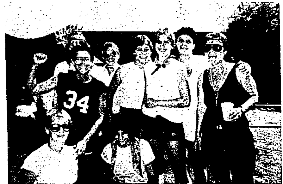
COLETTE'S WEST "BULLDOGS"

TUCSON - The Tucson Lesbian and Gay Pride Committee sponsored a challenge volleyball match between Colette's West "Bulldogs" and the Joshua Tree "Pussycats" Sunday, August 5 at the JT/BP. The event, won by the "Pussycats" four games to zero (best of seven), raised $50 through beer donations during the afternoon.